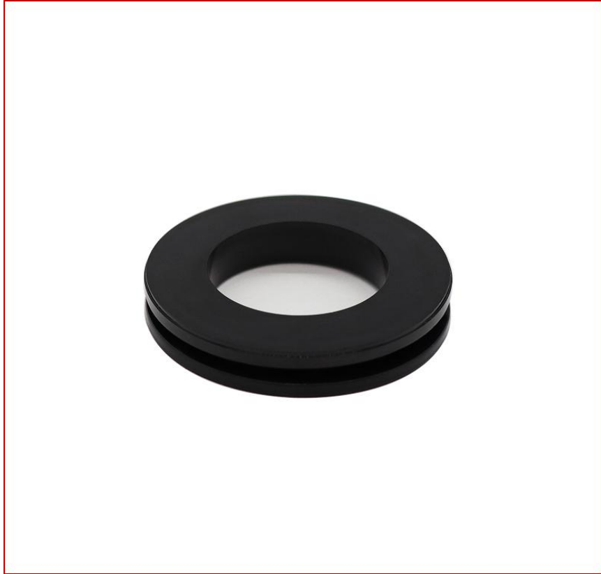
➤ Insulating washers