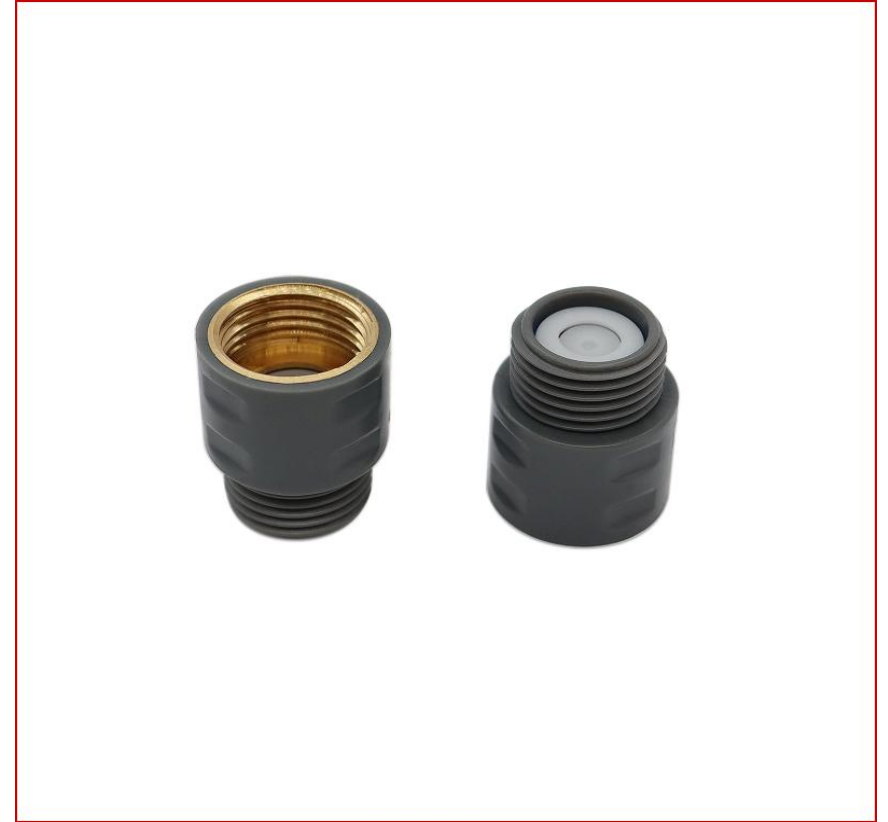
➤ check valves